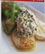
From the Capella dining room