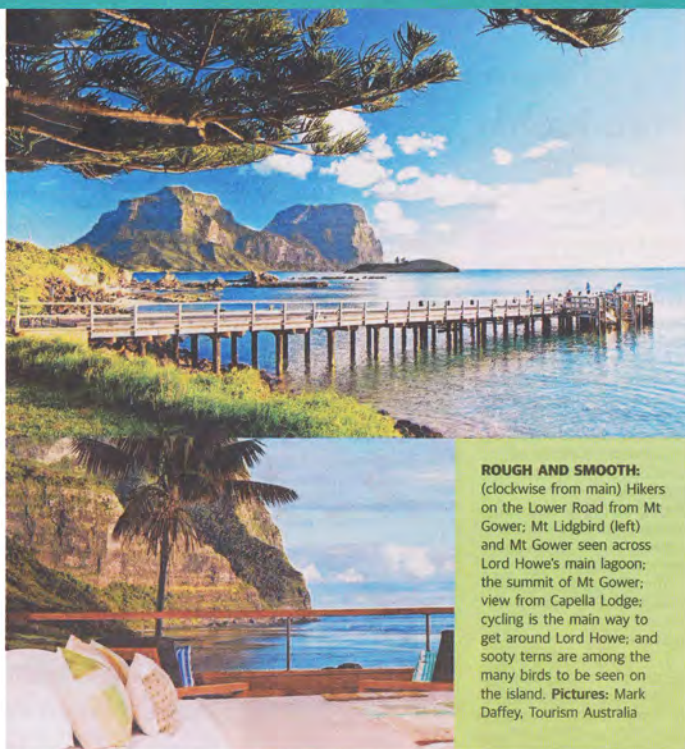
ROUGH AND SMOOTH: (clockwise from main) Hikers on the Lower Road from Mt Gower; Mt Lidgbird (left) and Mt Gower seen across Lord Howe's main lagoon; the summit of Mt Gower; view from Capella Lodge; cycling is the main way to get around Lord Howe; and sooty terns are among the many birds to be seen on the island.

draws on more than 120 years of ancestral practise to shimmy up the trunk to show how the seeds are collected for export.